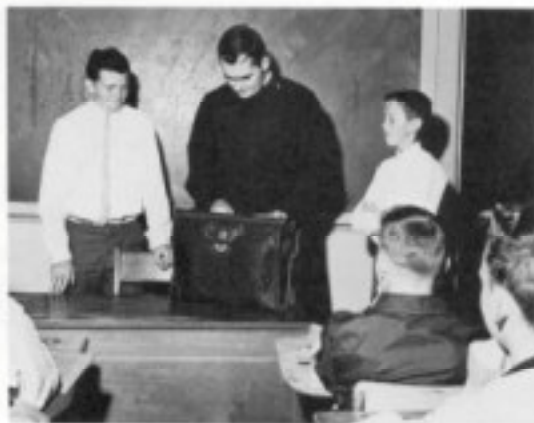
"Let's see what I have for you."