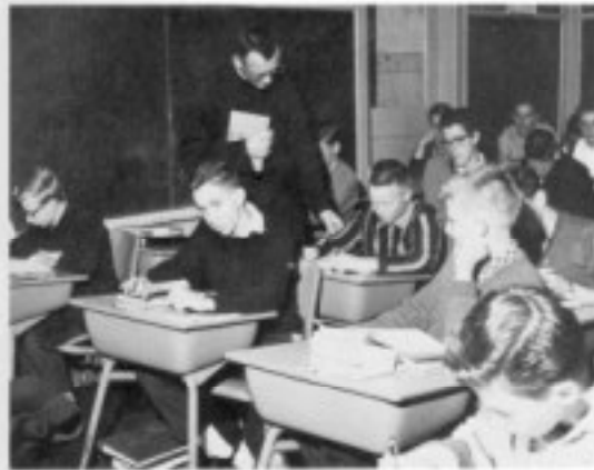
"What do you mean you left your homework at home?"