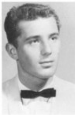
"That one's mine."