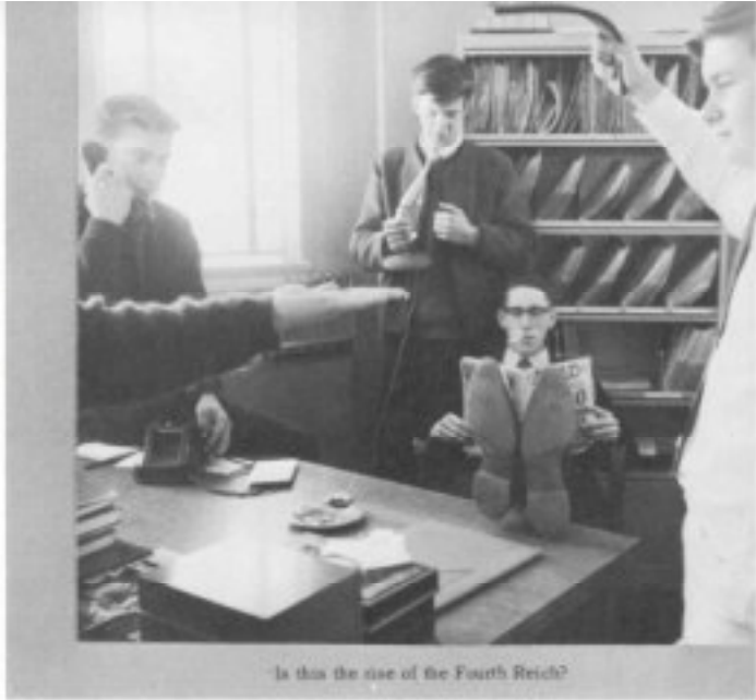
Is this the rise of the Fourth Reich?