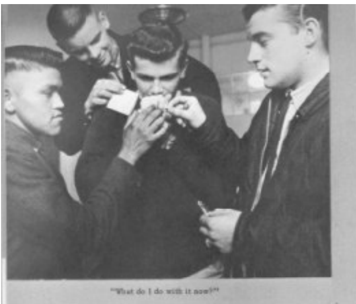
"What do I do with it now?"