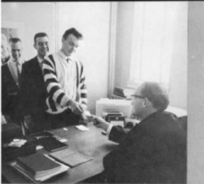
Another day . . . , another detention.