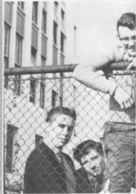
THE GREAT ESCAPE

Class Officer 12 Basketball 12 Intramurals 11, 12