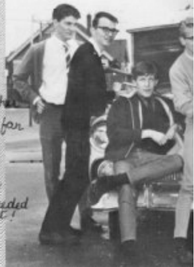
MUSIC TO WRECK A CAR BY.